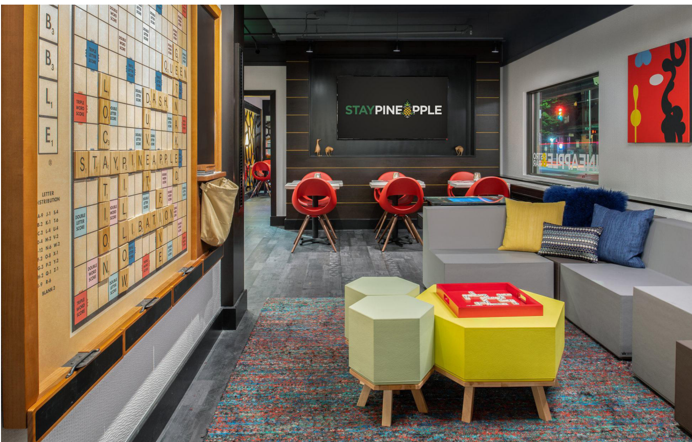
All images shown can be found online at sixinchusa.com