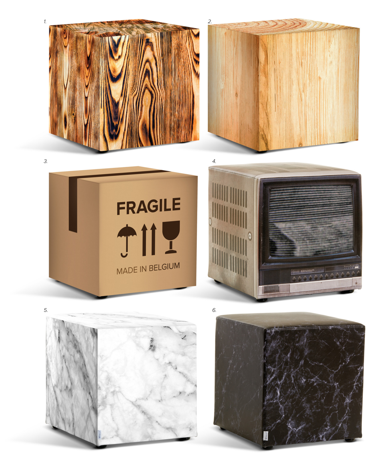
1. Burnt Wood / 2. Chopped Wood / 3. The Box / 4. Monitor / 5. White Marble / 6. Black Marble

All images shown can be found online at sixinchusa.com