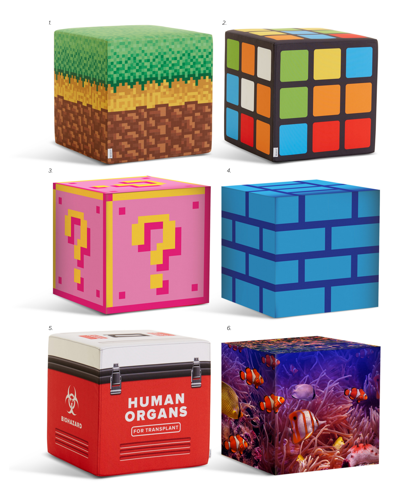
1. 8-Bit / 2. Cube / 3. Question / 4.Brick / 5. Organ / 6. Under the Sea

All images shown can be found online at sixinchusa.com