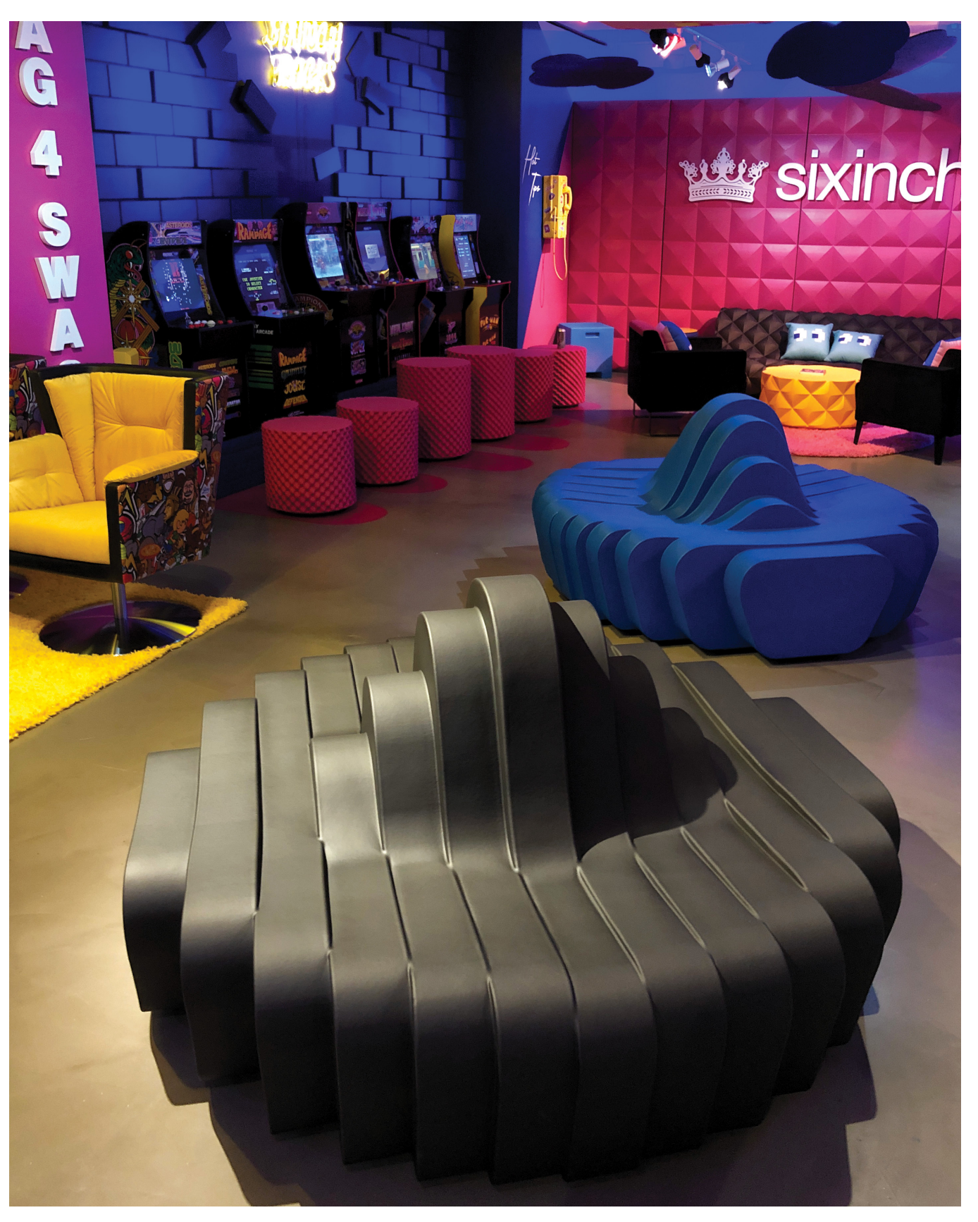
All images shown can be found online at sixinchusa.com